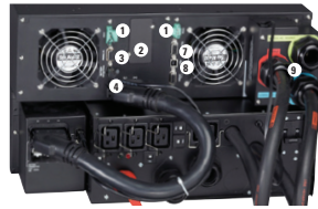
Eaton 9PX 8-11kVA UPS