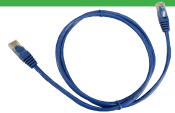
T568A Cabling Pinout Specifications