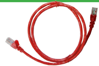
T568A Cabling Pinout Specifications